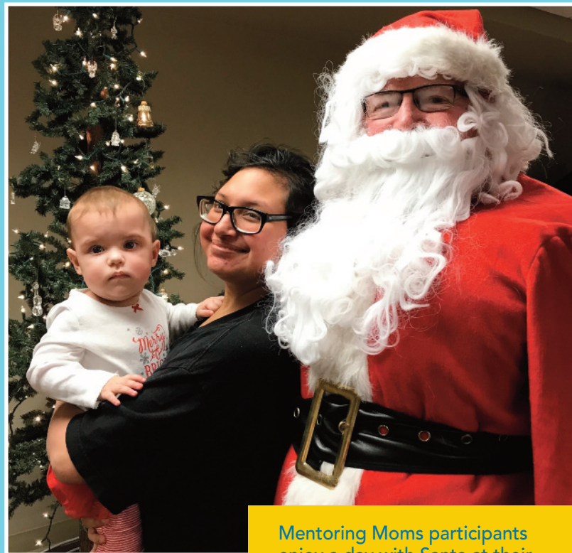
Mentoring Moms participants enjoy a day with Santa at their annual Christmas party.

3,338 nights of safety were spent at The Shelter