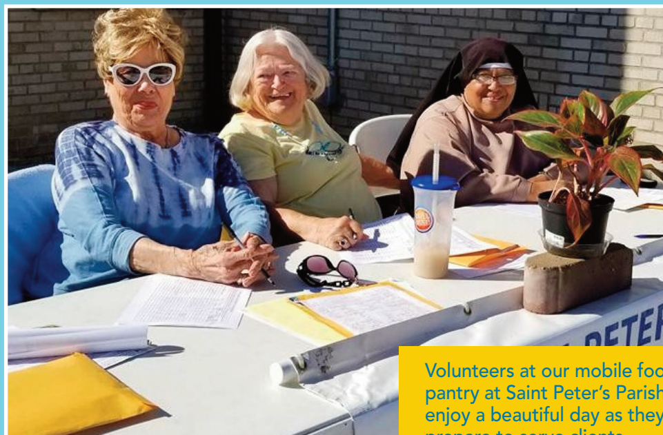
Volunteers at our mobile food pantry at Saint Peter's Parish enjoy a beautiful day as they prepare to serve clients.

200,000 pounds of food were distributed through our three Food Pantries